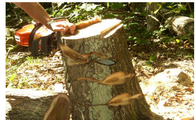
Chainsaw Basics Practice