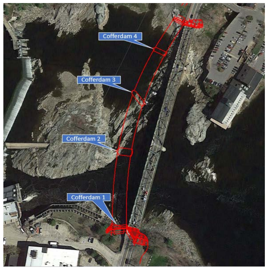
Figure 2-3. Schematic showing proposed locations of cofferdams required for installation of new Brunswick-Topsham Bridge.

The bridge superstructure (girder spans, stringers, deck, railings, and wearing surface) will be built once the concrete piers and abutments are completed. The northernmost bridge spans will be lifted by a single crane stationed on the adjacent temporary work trestle. However, the construction of the 260 foot span between the Brunswick abutment and pier 1 will be challenging. The proposed bridge replacement includes a span length of 260 feet stretching from the southernmost pier to the abutment on the Brunswick side. Conversations with designers revealed that the 260 foot bridge span length will require two specialized cranes to simultaneously lift the longer beams. One crane will be deployed adjacent to the new abutment on the Brunswick side, and a second crane will be placed on the temporary trestle over the lower portion of the tailrace. Located on either end of the 260 foot span, the two cranes will perform a dual lift of the southern span.