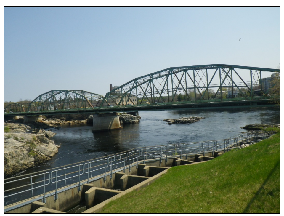
Figure 2-1. View of the existing Frank J. Wood Bridge as seen from the upstream side and western shoreline.