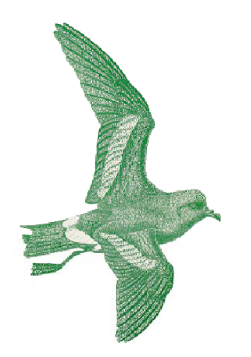
Figure 1. Leach's Storm-Petrel (sketch by Paul Donahue in Pierson (1978))

(culmen: 1.5 cm), legs, and feet are black (Knight 1908, Palmer 1962, Cowger 1976 b , Peterson 1980, Terres 1980, Harrison 1983).