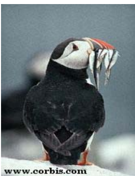
Fig. 1. Atlantic Puffin

Atlantic Puffin --Atlantic Puffins (Fig. 1) have a short, thick neck and short, blunt