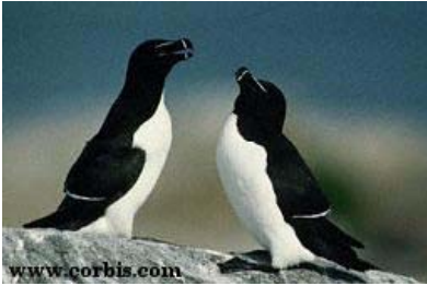
Fig. 2. Razorbills

Razorbill —Razorbills (Fig. 2) are distinguished from other alcids by a thick bill, up-tilted tail when swimming, and an arched back in flight (Cowger 1976). They have a short neck and tail and narrow wings. Wingspan in Razorbills is 62 cm (Freethy 1987), with wing length ranging 188-201 mm for males and 194-198 mm for females (Johnsgard 1987). Tarsus length is 36 mm