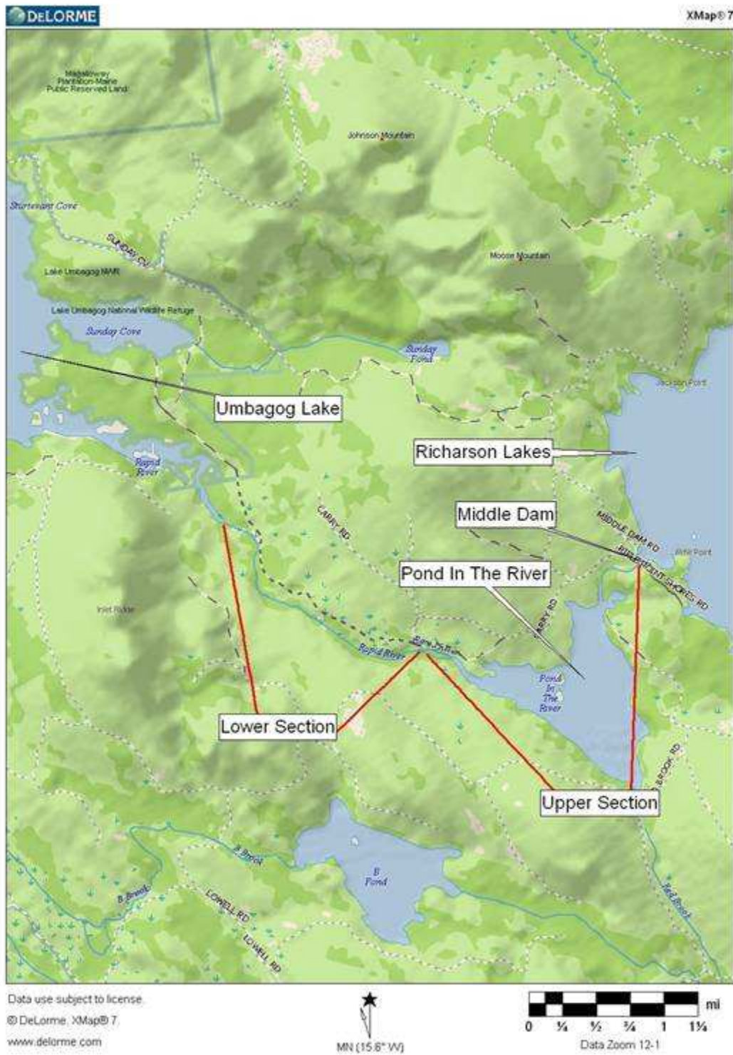
Figure 1. Site location map for Rapid River creel surveys, 1998-2016