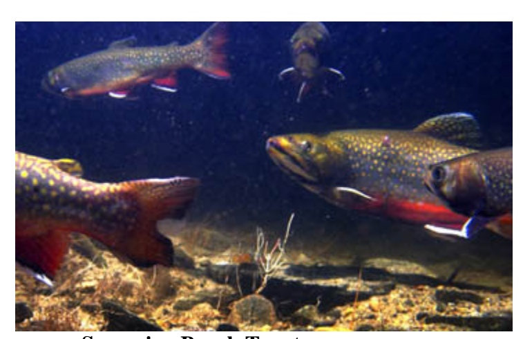
Spawning Brook Trout.

Life History: Mature brook trout, typically II+ to III+ years of age, spawn in gravelly substrate over upwelling ground water in the fall (late September – November). In Maine, the earliest spawning occurs in high-elevation waters and/or more northern latitudes. Water moving through the gravel prevents the buried eggs from freezing and provides them with oxygen. Spawning generally occurs in streams; however, shore spawning is successful in some ponds where springwater inflows occur in gravelly or sandy shallows.