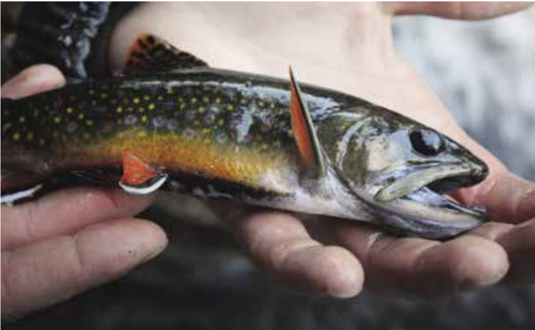
Please review Maine's Freshwater Fish Consumption Advisory at mefishwildlife.com/fishconsumptionadvisory