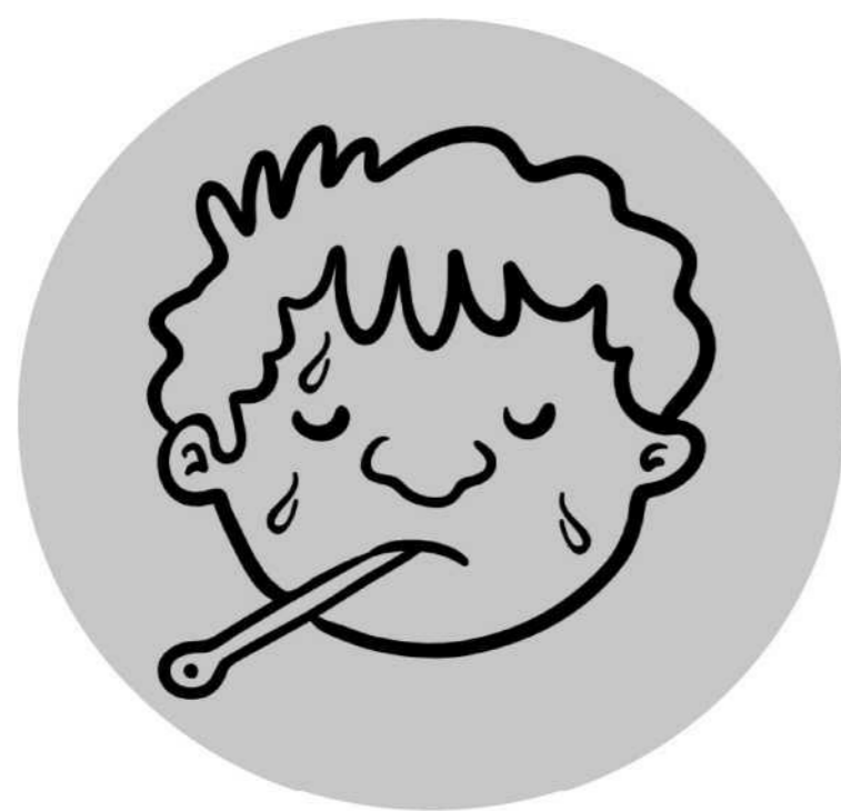
Fievre ya Makasi