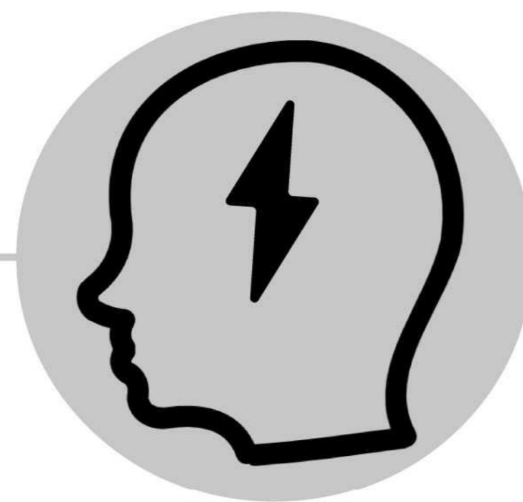
Mutu mpe Nzoto Mpasi