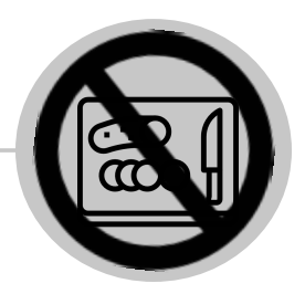
Do not prepare food for others if you have norovirus and for 2-3 days after symptoms end