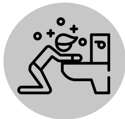
Nausea and Vomiting