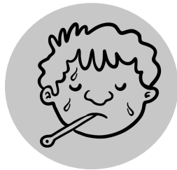
Fever and Chills