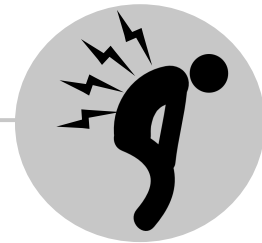
Body and Muscle Pain