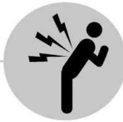
Muruqyo Go'go iyo Xanuun