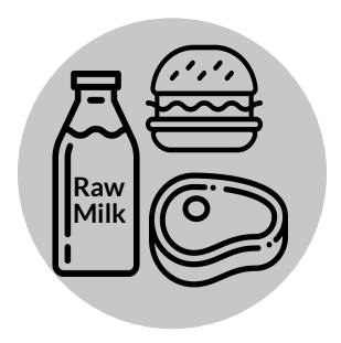
Eating undercooked meat or unpasteurized (raw) dairy products