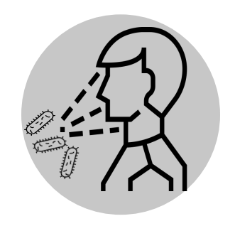
Getting bacteria into wounds or nose, mouth, or eyes