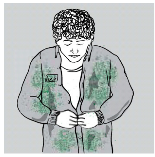
Change into clean clothes and shoes at work before you get into your car or go home. Put dirty work clothes and shoes in a plastic bag.