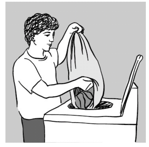
Wash work clothes separately from all other clothes. Empty your work clothes directly from the plastic bag into the washing machine and wash them. Run the empty washing machine again to rinse out the lead. (It is better if your employer washes the work clothes).

The Department of Health and Human Services (DHHS) does not discriminate on the basis of disability, race, color, creed, gender, age, sexual orientation, or national origin, in admission to, access to or operation of its programs, services, activities or its hiring or employment practices. This notice is provided as required by Title II of the Americans with Disabilities Act of 1990 and in accordance with the Civil Rights Acts of 1964 as amended, Section 504 of the Rehabilitation Act of 1973 as amended, the Age Discrimination Act of 1975, Title IX of the Education Amendments of 1972 and the Maine Human Rights Act. Questions, concerns, complaints, or requests for additional information regarding civil rights may be forwarded to the DHHS' ADA Compliance/EEO Coordinator, State House Station #11, Augusta, Maine 04333, 207-287-4289 (V) or 207-287 3488 (V), TTY: 800-606-0215. Individuals who need auxiliary aids for effective communication in programs and services of DHHS are invited to make their needs and preferences known to the ADA Compliance/EEO Coordinator. This notice is available in alternate formats, upon request.