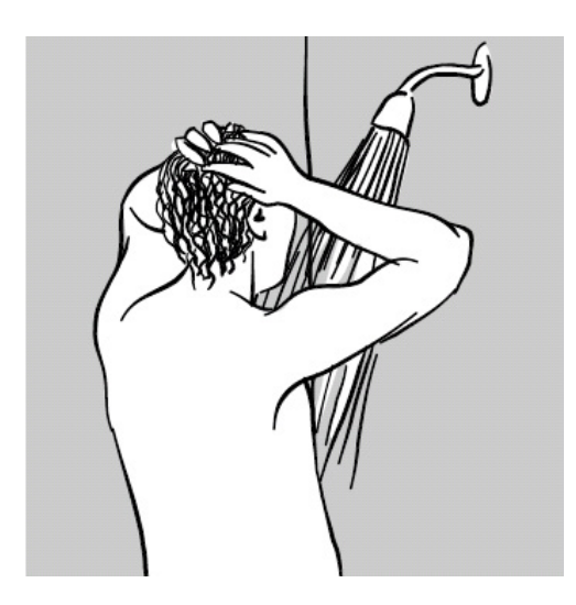
Take a shower and wash your hair as soon as you get home. (It is better to shower at work if you can).

If you have any questions, call the Childhood Lead Poisoning Prevention Unit toll free in Maine. 1-866-292-3474