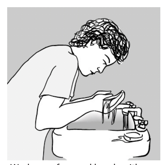
Wash your face and hands with soap and warm water before leaving work.