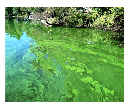
Algal bloom on Sabattus Pond

Harmful algal blooms, also known as blue-green algae or cyanobacteria, are a major environmental and drinking water issue across the country. They typically form in warmer, nutrient-rich waters and can have impacts on human health, aquatic ecosystems, and the economy. While some algal blooms can be non-toxic, others are known to produce substances