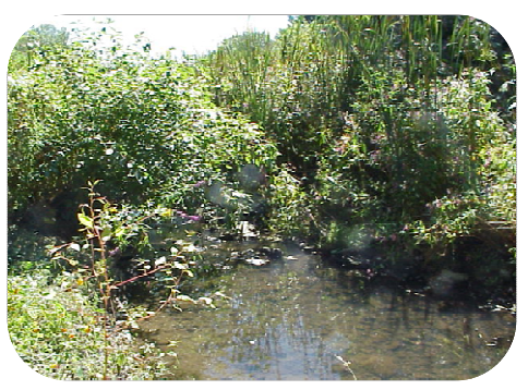
Capisic Brook below Lucas Street.

pollutants, and help protect both water quality in the stream and stream channel stability.