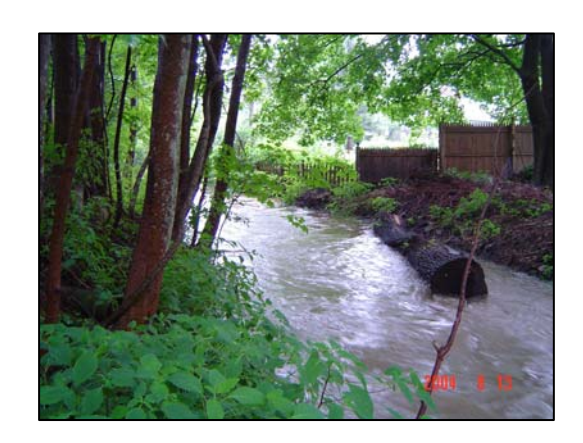
Fig. 6. Above Ocean Street