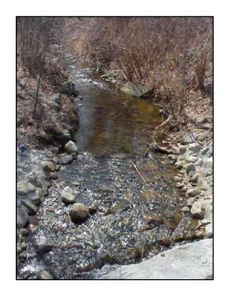
Fig. 4. Above Highland Avenue (biomonitoring station S302), 4/2003