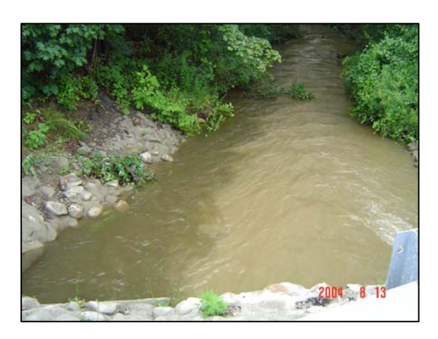
Fig. 11. Stormflow conditions below Highland Avenue bridge, confluence of Trout Brook (right plume) and Kimball Brook (left plume), 8/2004