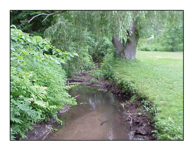
Fig. 12. Lawns in riparian zone