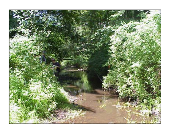
Fig. 3. Above Boothby Avenue (biomonitoring station S675), 7/2003