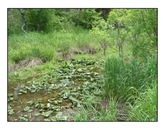
Fig. 2. Wetland area along Sawyer Street, 6/2003