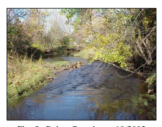
Fig. 5. Below Broadway, 10/2003