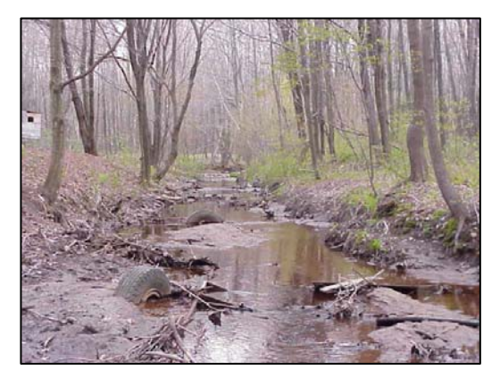
Fig. 12. Sedimentation at S672, 5/2004