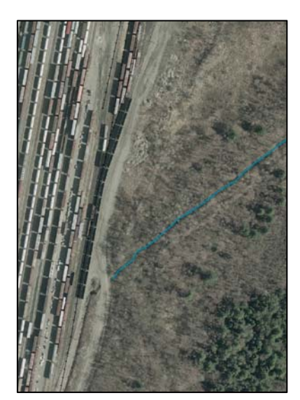
Fig. 8. Railway influence above upstream wetland