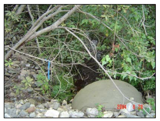
Fig. 5. Along Dartmouth Street