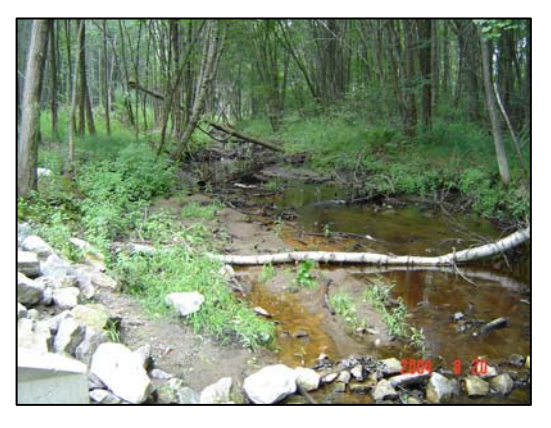
Fig. 6. At S672 (along Greenbelt)