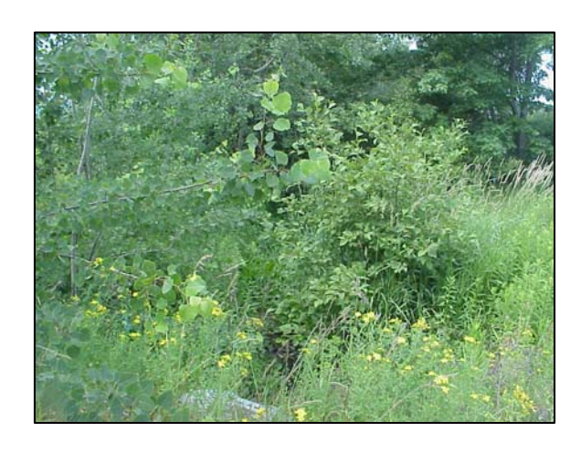
Fig. 1. Along Dartmouth Street, 7/2003