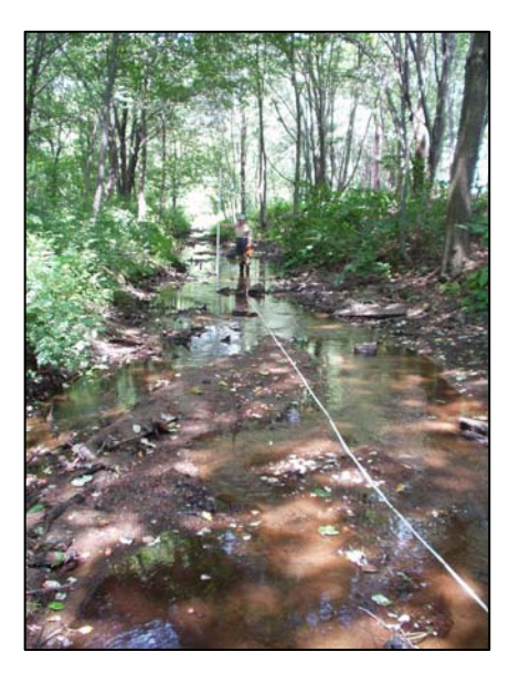
Fig. 2. Along Greenbelt Walkway (biological monitoring station S672), 7/2003