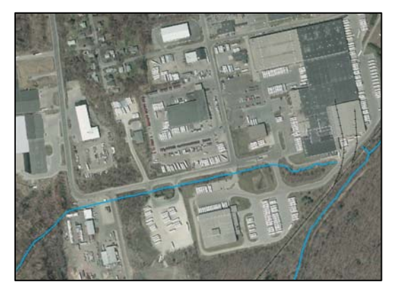
Fig. 10. Impervious surfaces near stream