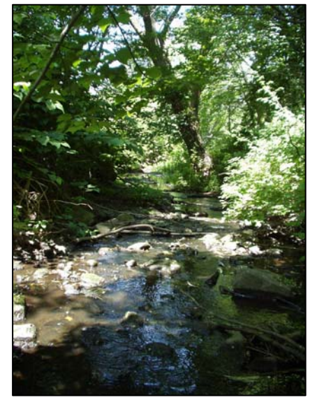
Fig. 4. Below Broadway, 7/2003