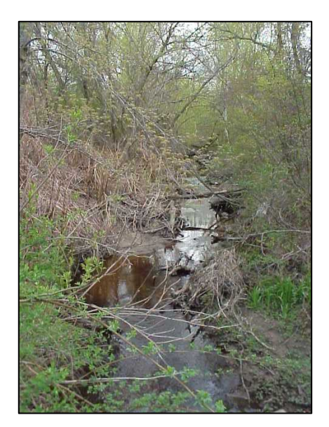
Fig. 3. At Taylor Lane (biological monitoring station S387), 5/2004