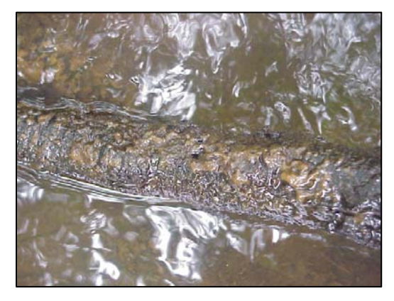
Fig. 13. Log with growth (bacteria, algae, fungi) at S672, 7/2004