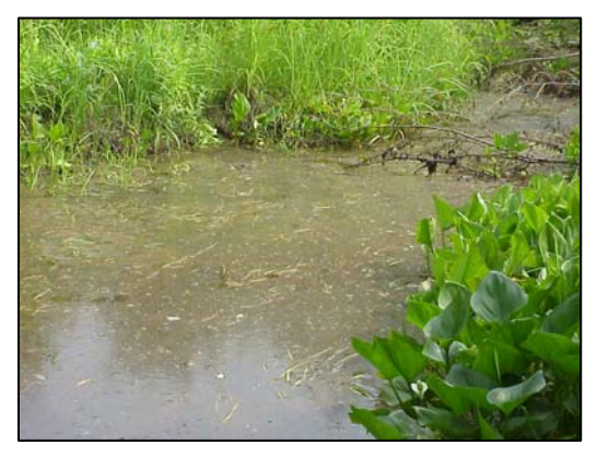
Fig. 9. Impaired water quality at outflow of upstream wetland (7/2003)