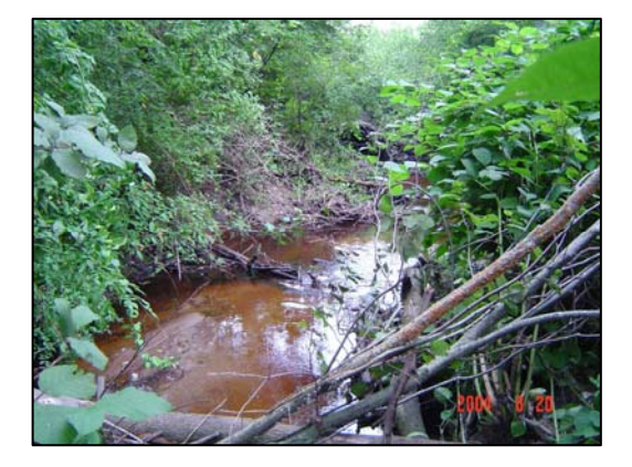
Fig. 7. At S387 (at Taylor Lane)