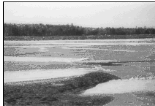
Ice out on Sebago Lake, spring 1985