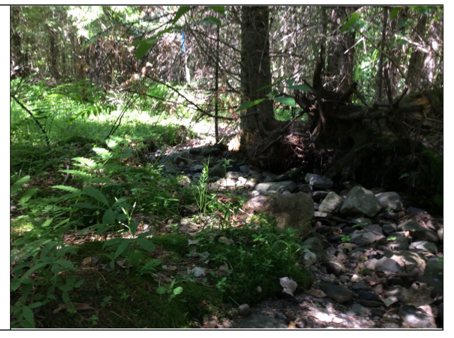
Photo: 28 Description: S28EI Date: June 16, 2020