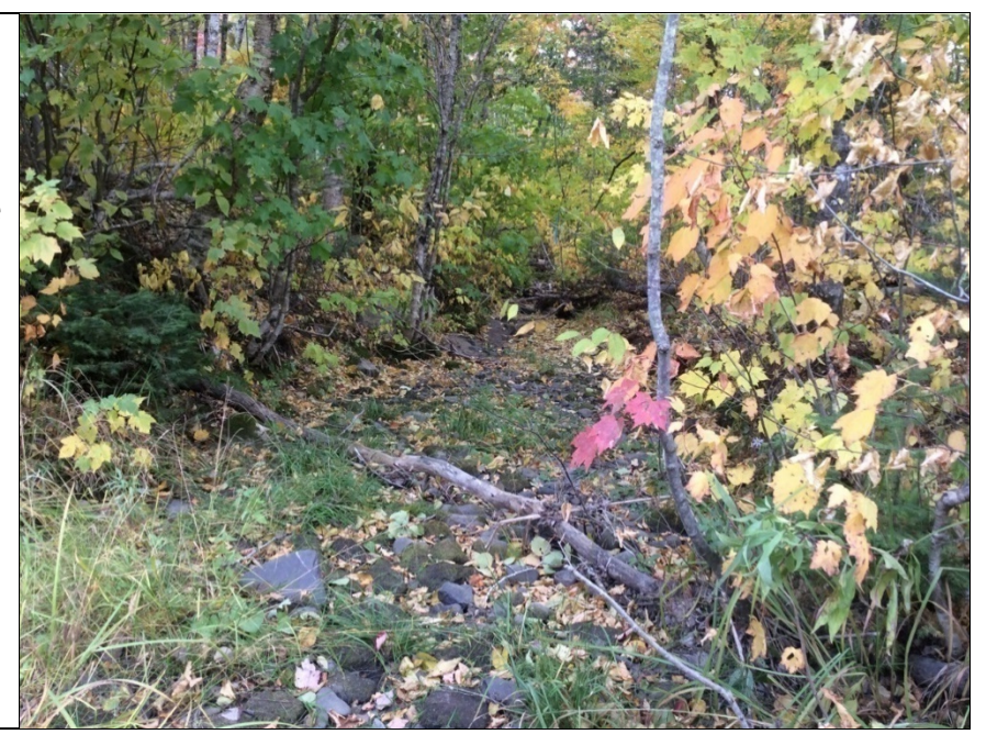
Photo: 32 Description: S53El Date: September 23, 2020