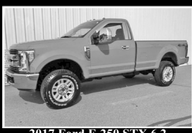
2017 Ford F-250 STX 6.2 only 16k, $41,999