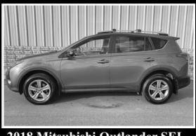
2018 Mitsubishi Outlander SEL FWD, 38k, $16,999