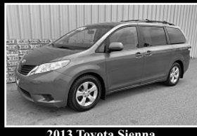
2013 Toyota Sienna 172k, $10,750