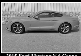
2015 Ford Mustang V-6 Coupe 23k, $19,950

Sell Us Your Car! Not happy with your trade in allowance at a Big Box Dealer? Having trouble selling your car privately? Come see us! We will make you a CASH OFFER on the spot!