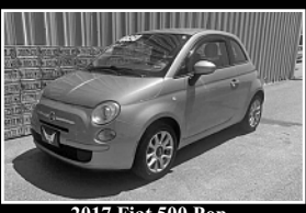
2017 Fiat 500 Pop 102k. $8,850