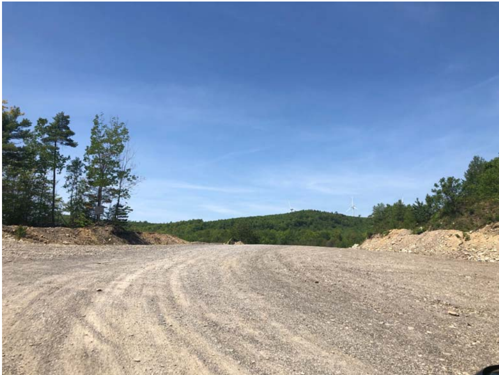
Photo 4: Entrance to Pomoroy Logging Inc. Compound from Springy Road – Looking West