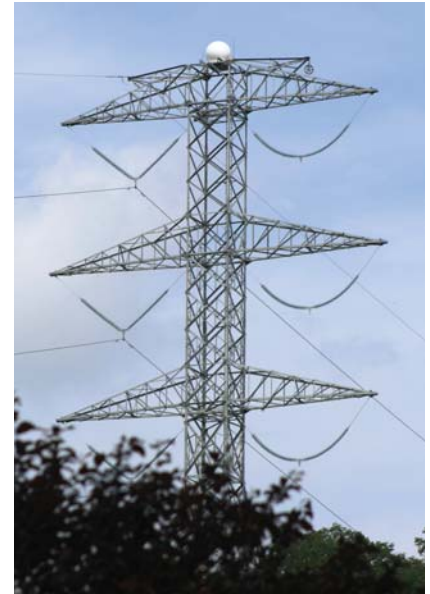
BELOW: HARRIER Utility tower installation

The HARRIER system is based on DeTect's MERLIN radar software and hardware platforms originally developed to detect and track low altitude, variable radar cross section (RCS), irregularly moving targets. HARRIER is not a modified aircraft or ship tracking system and all detection and tracking algorithms were specifically developed and programmed to 'look' for and follow targets with these complex characteristics to provide highly sensitive, reliable operation. DeTect's HARRIER radar processing software is user customizable and software definable to 'tune' the system to detect, track, and display only targets within the user desired target class based on a variety of parameters that include size, speed and track characteristics. Additionally, by using the S-band 3050 MHz frequency range, DeTect greatly minimizes the likelihood of frequency conflict with other systems such as air traffic control, weather radars, and communications networks.