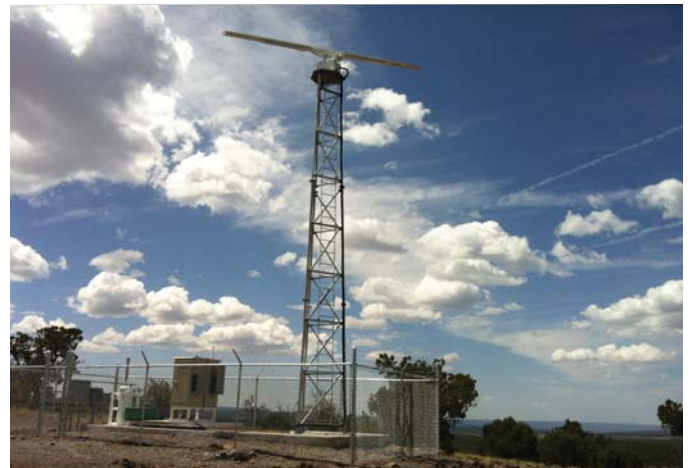
ABOVE: The HARRIER ADLS is typically supplied as a fixed, self-contained skid mounted system for ground based installation. BELOW: HARRIER ADLS web display