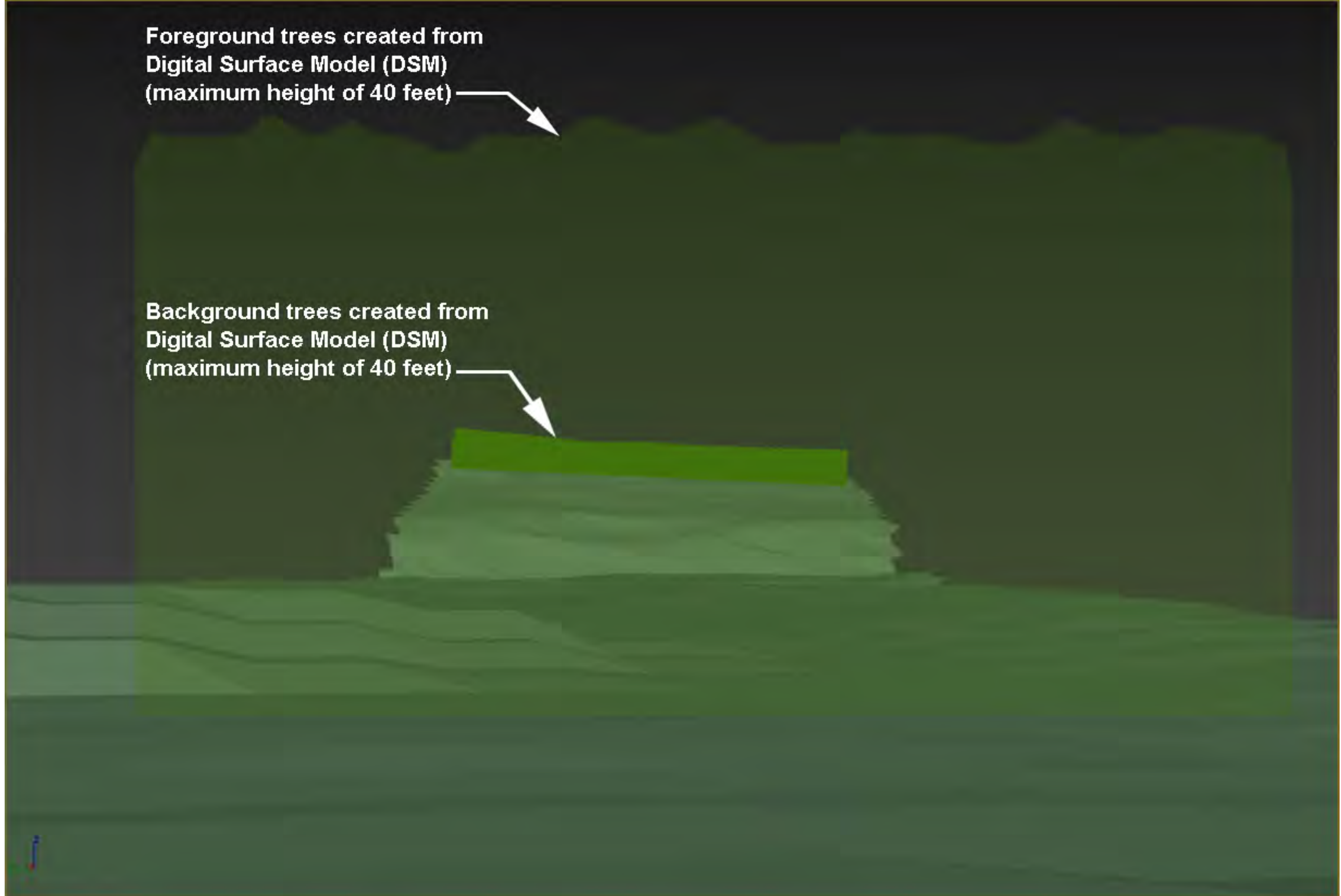
3DS MAX Ellis River at a beach_terrain and landcover_use

Background trees created from Digital Surface Model (DSM) (maximum height of 40 feet)