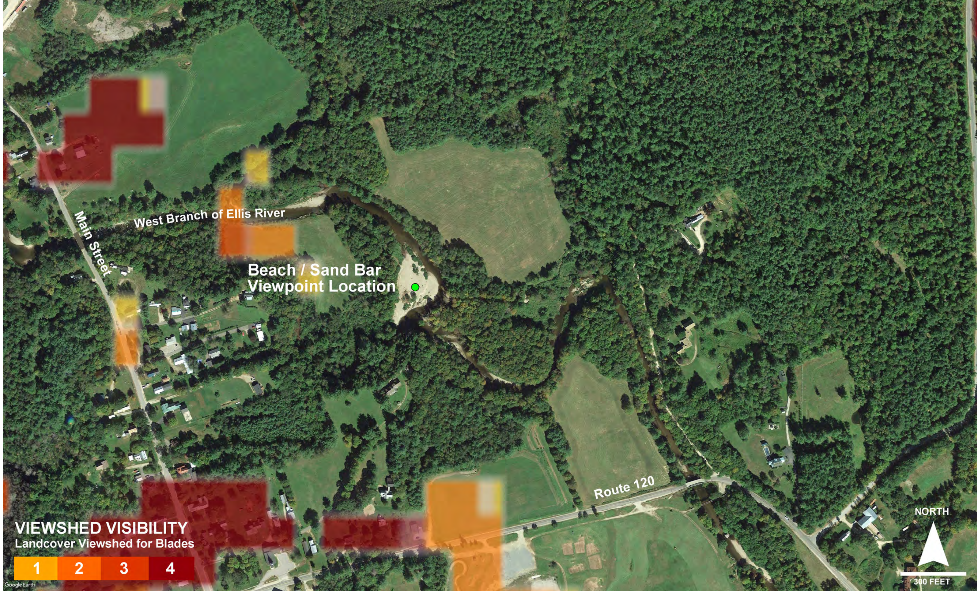
Google Earth WB of Ellis River at a beach area_AERIAL 2