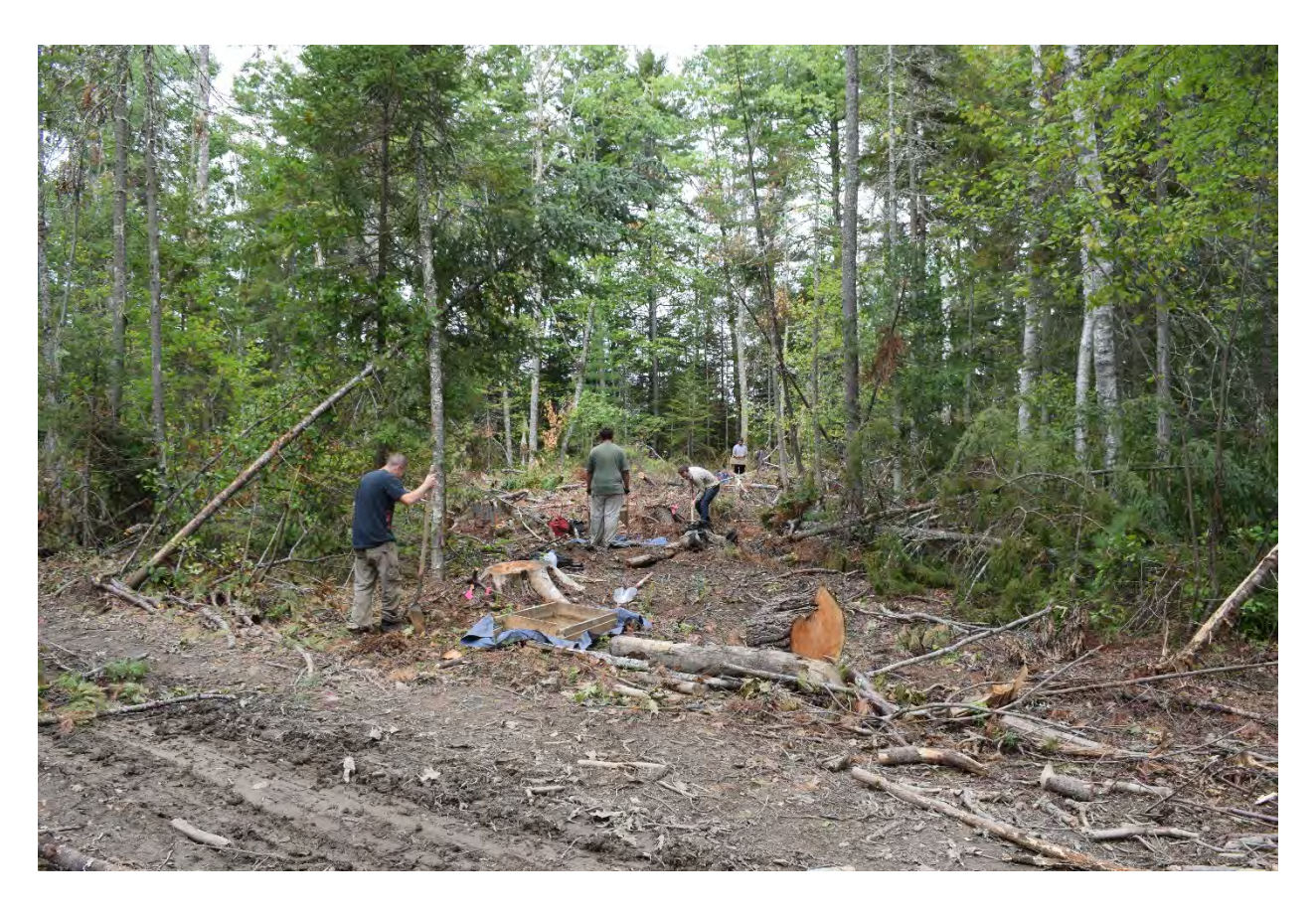
Figure 3. General view south of crew excavating along archaeological phase I sampling Transect T6 within the proposed Nordic Aquafarms Development Project (MHPC# 0737-18), Belfast, Waldo County, Maine. Note recent logging activity.