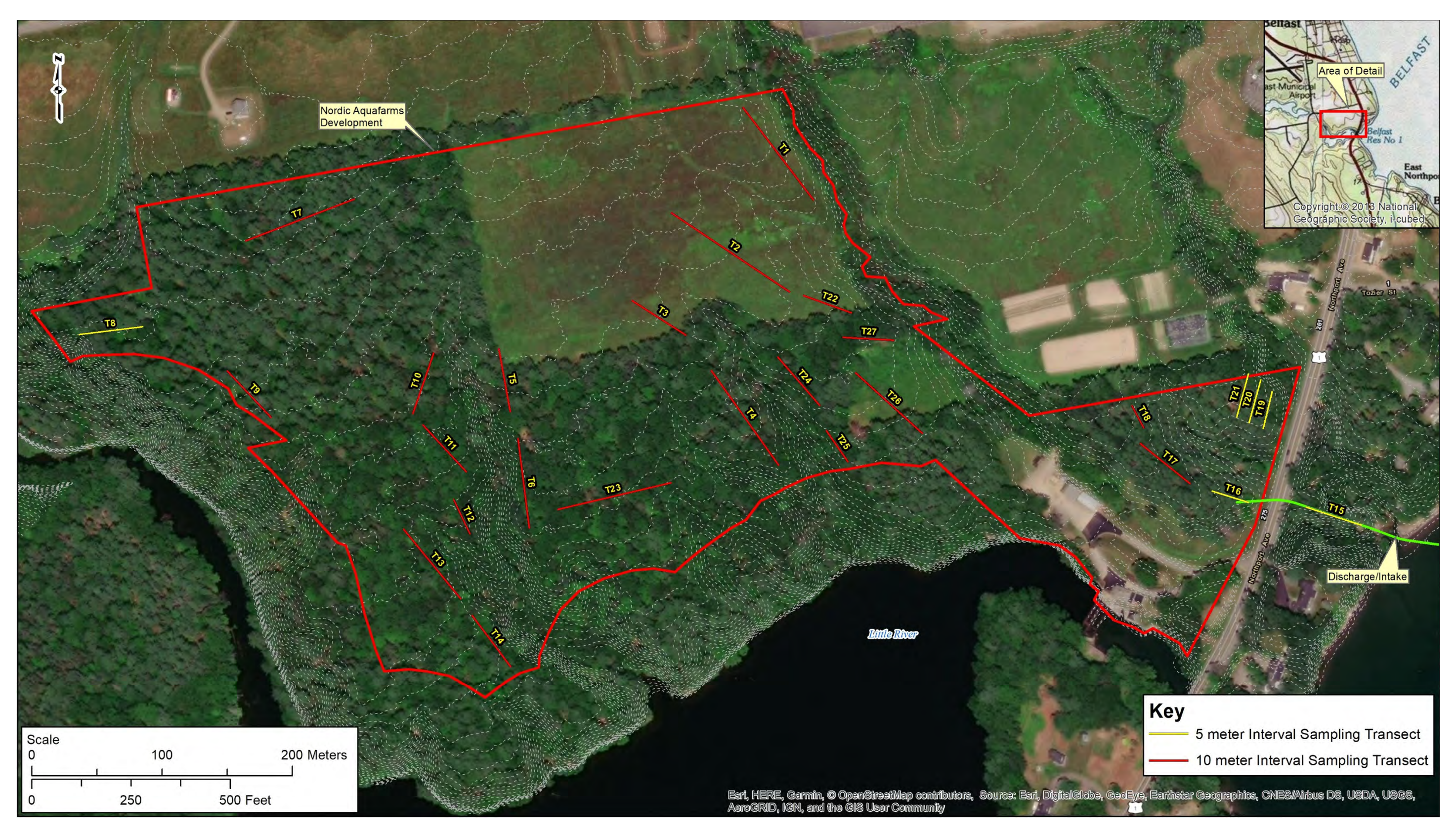
Figure 2. Aerial photograph with 2ft contours showing the approximate boundaries of the proposed Nordic Aquafarms Development Project (MHPC# 0737-18), Belfast, Waldo County, Maine. Note locations of archaeological phase I sampling transects.