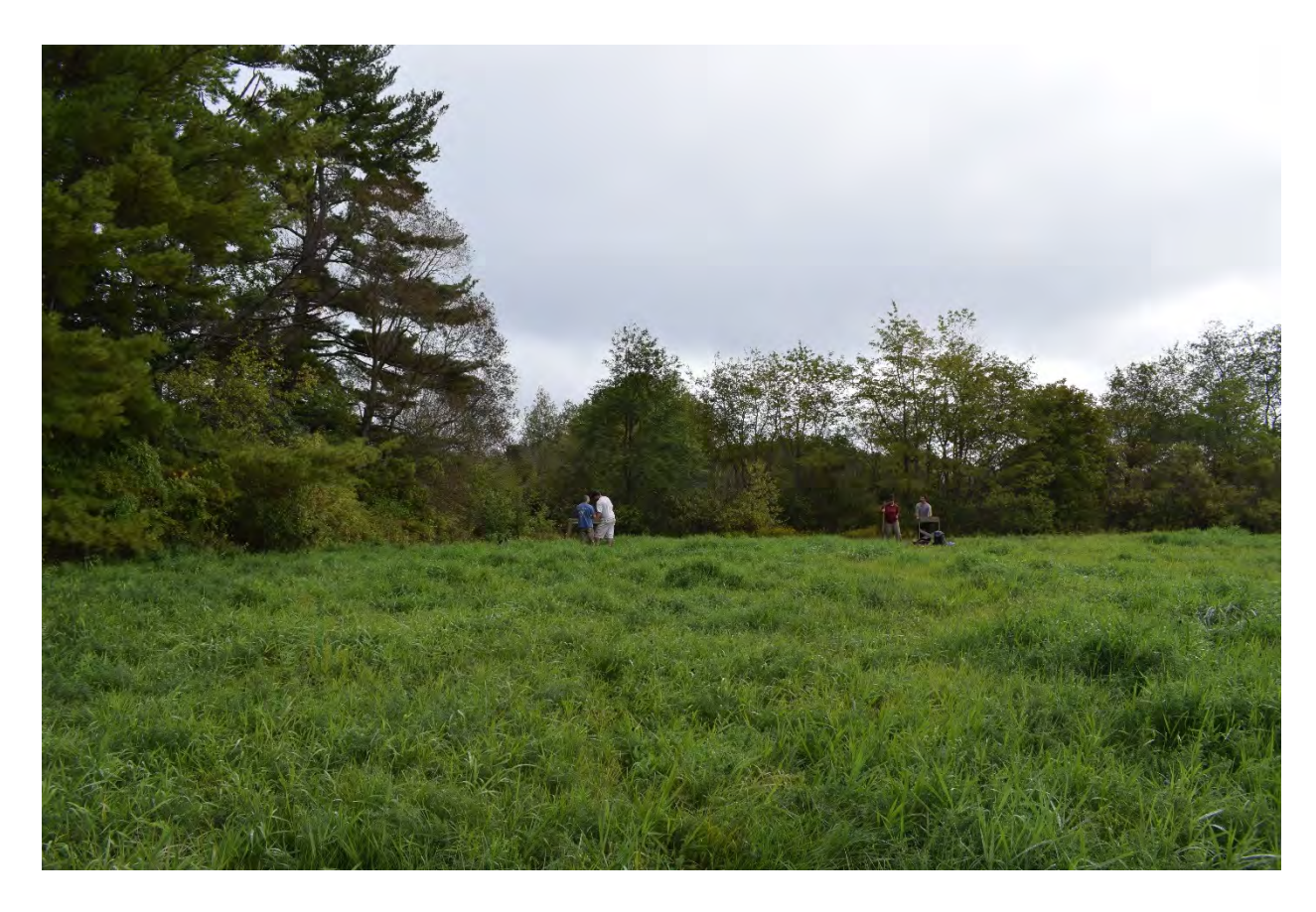
Figure 4. General view west of crew excavating along archaeological phase I sampling Transect T1 within the proposed Nordic Aquafarms Development Project (MHPC# 0737-18), Belfast, Waldo County, Maine.