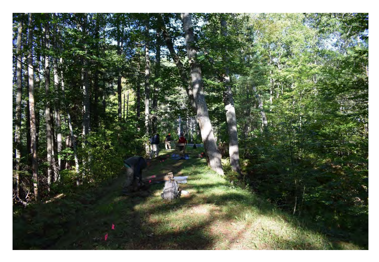
Figure 5. General view northwest of crew excavating along archaeological phase I sampling transect T15 in the area of the proposed discharge and intake lines within the proposed Nordic Aquafarms Development Project (MHPC# 0737-18), Belfast, Waldo County, Maine.