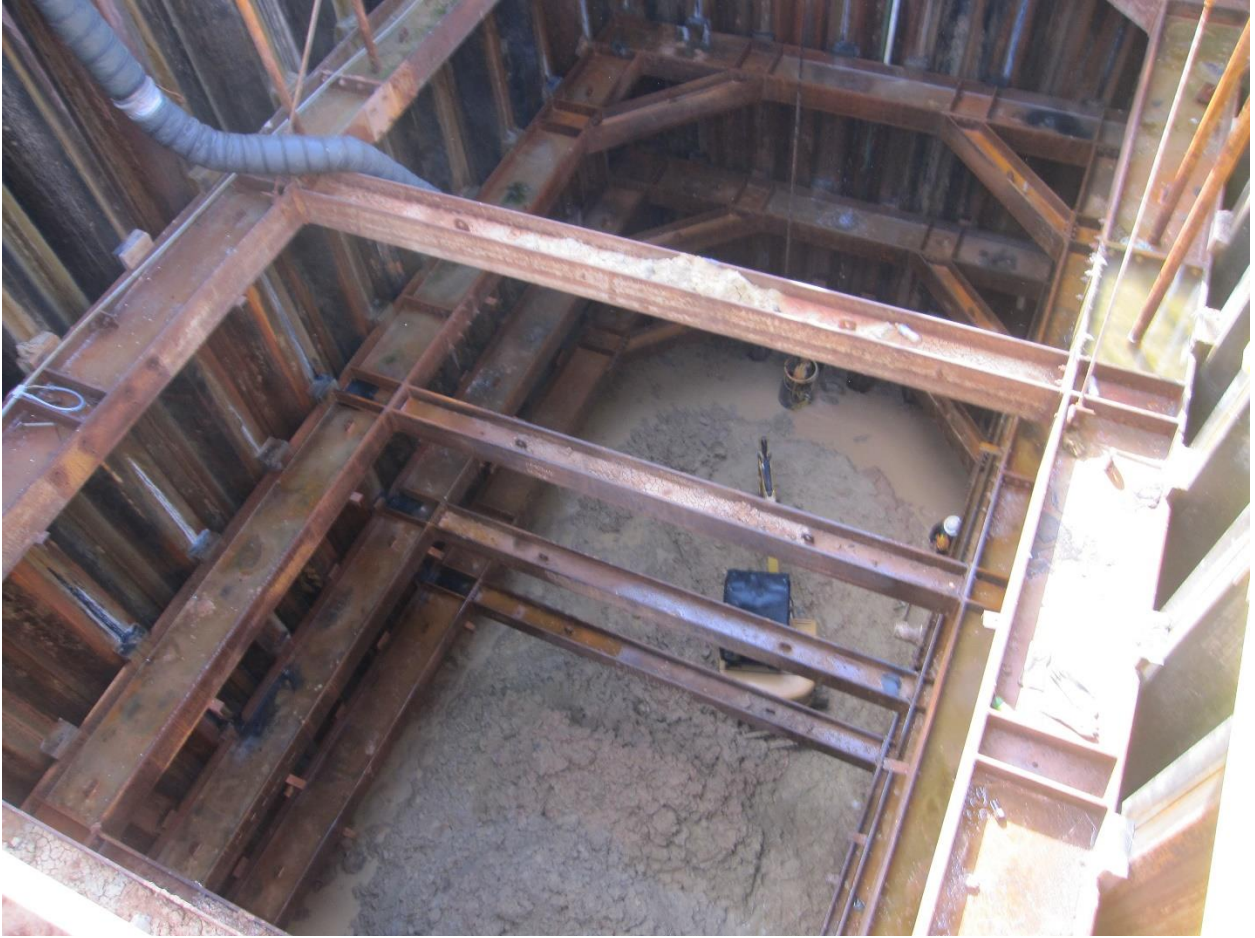
Photo 3: Example of a narrow sheet pile structure with struts to suit this type of work.