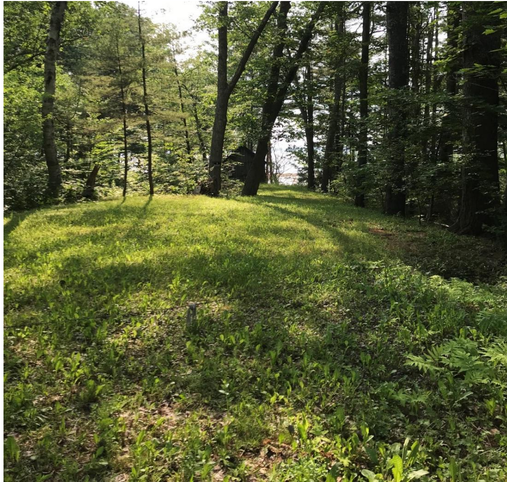
Photo 1: Upland route looking east over the “horseback” roadway zone at the Eckrote property