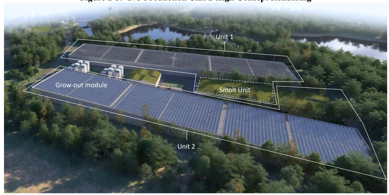
Figure 2-3: 1+3 Production Unit Design Concept Rendering

A pair of production units provides optimal scale for a long-term facility development in Belfast. This site lay-out enables the facility to grow in phases, along with new jobs, secondary business opportunities for Maine businesses, and tax benefits to Belfast.