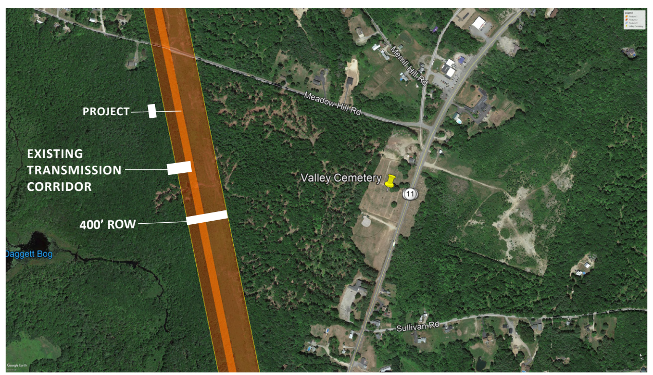
Plan View Valley Cemetery. The Project will be 0.32 miles west of the structure.