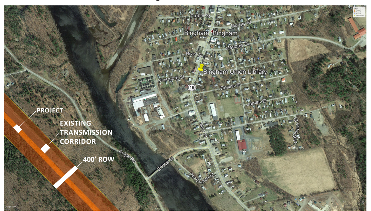
Plan View Bingham Union Library. The Project will be 0.55 miles south west of the structure.