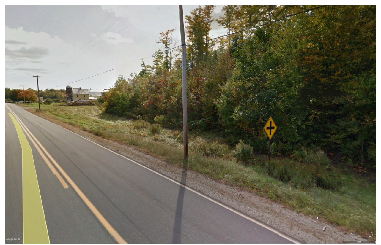
Street View Standing in front of the Garfield School looking southeast on Rt. 16. Tips of structures may be visible above dense trees between the school building and the Project.