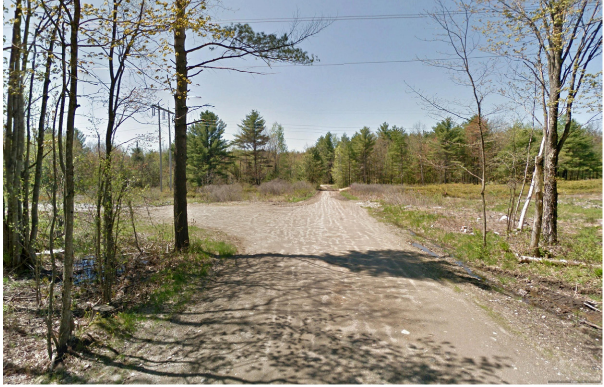
Street View Looking west toward the Maine Central Railroad from Hillman Ferry Rd. Resource is an active rail line in a 400 ft transmission corridor with an existing 115 kV transmission line and gravel road.