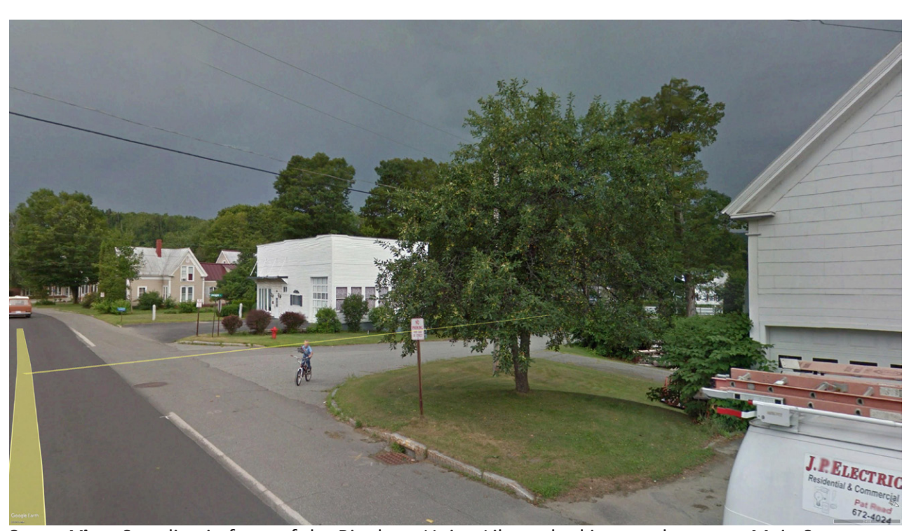
Street View Standing in front of the Bingham Union Library looking southwest on Main Street. Any views would be obstructed by village homes between the library and the Project.