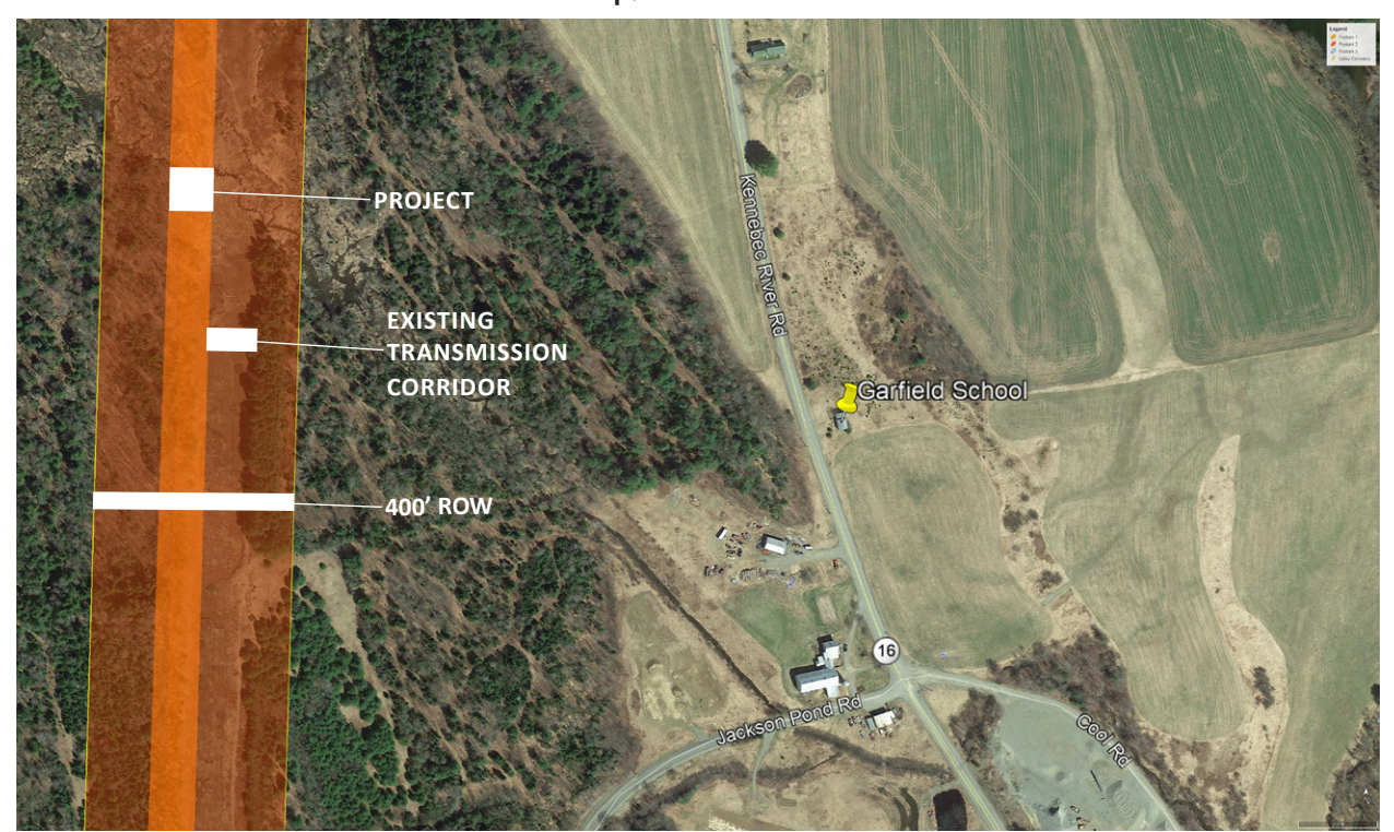
Plan View Garfield School. The Project will be 0.26 miles west of the structure.