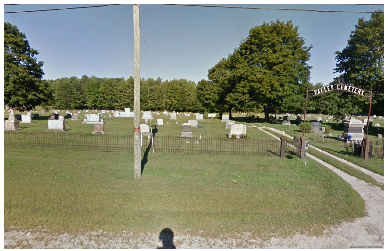
Street View Looking northwest towards the Valley Cemetery from Route 202. Tips of structures may be visible above dense trees between the Cemetery and the Project.