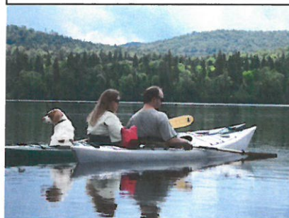
Carr Pond Southern View With View of Bald Mt.