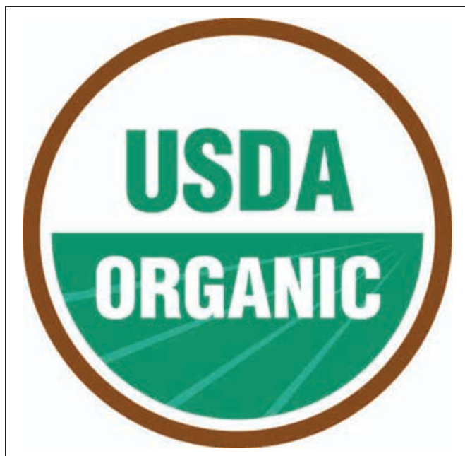
Figure 3—The USDA organic seal