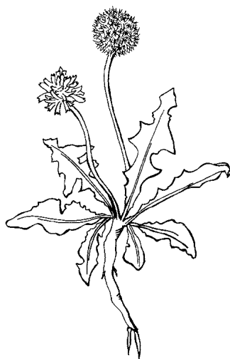
Figure 1. Dandelion.

Integrated Pest Management for Home Gardeners and Landscape Professionals