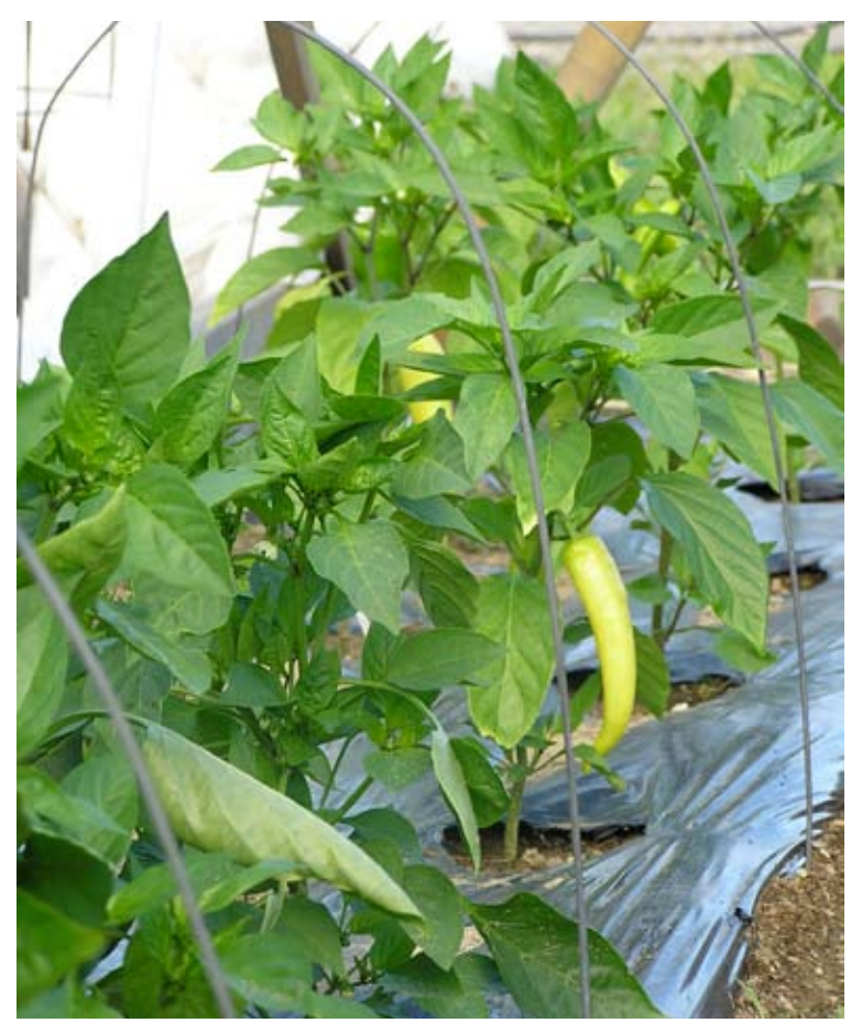
Black plastic, although loaded with negative environmental impact, warms the soil, conserves water and suppresses weeds.

Plants grown indoors are sensitive to the outdoor conditions of wide fluctuations in temperatures, direct sunlight and wind. Thus, seedlings should be hardened off (acclimated) before they are set in the garden. Hardening off is best accomplished in a cold frame. A week or two before the date when the transplants can be safely set in the garden, slowly introduce them to direct sun and evening temperatures by putting them in a cold frame (or just outside, in a protected spot) first for an hour or two a day and then gradually extending the time until they are out all day. Watch their water needs and keep an eye on the cold frame to ensure that the plants don't "bake" on sunny days.