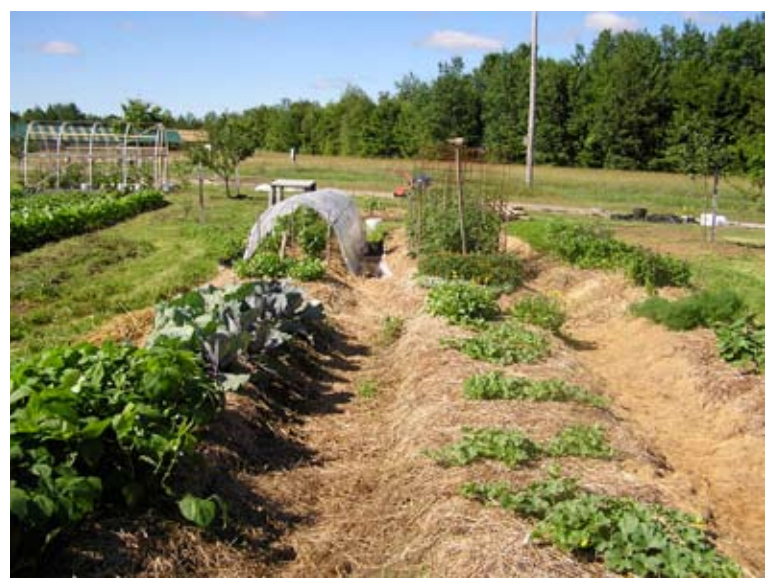
Raised beds are a great way to simplify gardening. Each bed can be treated as a distinct field and receive different amendments or cover crops.

Raised beds can dry out faster than level planting areas. If you have a very light, sandy soil, level gardens may be a better choice for you.