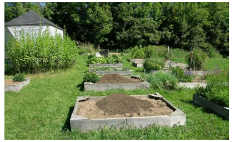
Mulching helps to manage weeds, conserve water and add organic matter to the soil.

Black plastic is very good at controlling weeds, conserving moisture and warming the soil. However, it does not decompose and needs to be picked up every fall. Because it warms the soil, black plastic frequently increases the yield of warm-season crops such as melons, peppers, eggplants and tomatoes. It is easier to lay the plastic before planting and plant through it than to lay it around plants. Lay the plastic and secure the edges with soil. Plastic is a nonrenewable resource and is a source of environmental pollution. It should not be an organic gardener's first choice of mulch. (Biodegradable plastic mulches made from cornstarch are available but are not approved for use in commercial organic production.)