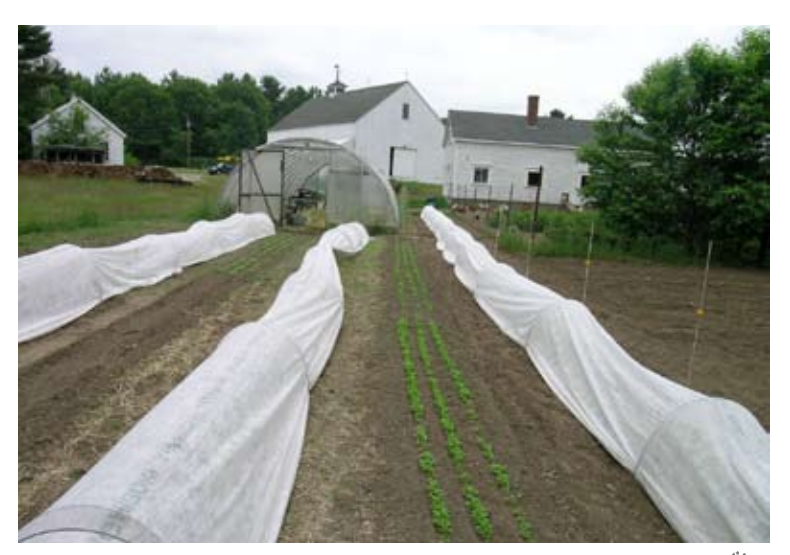
Row covers help keep out pests and keep plants warmer.

ROOT CROPS: A diverse group, these plants are all grown for their enlarged, fleshy roots, thrive in cool weather and can be planted early in the spring. Many of these crops can be mulched and harvested well into the winter. Most are biennials and will produce flowers early in their second year. They include beets, carrots, radishes and parsnips.