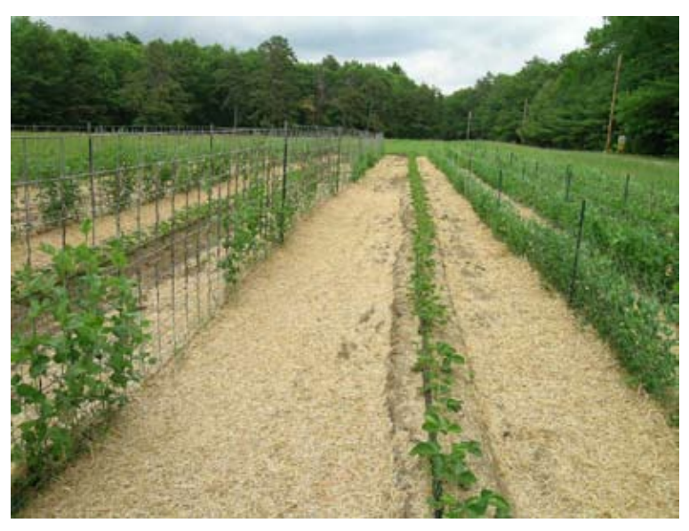
Staking vegetables increases yields and helps avoid diseases.

Yields per 50-foot row: eggplant—50 pounds; tomato—100 pounds; pepper—23 pounds