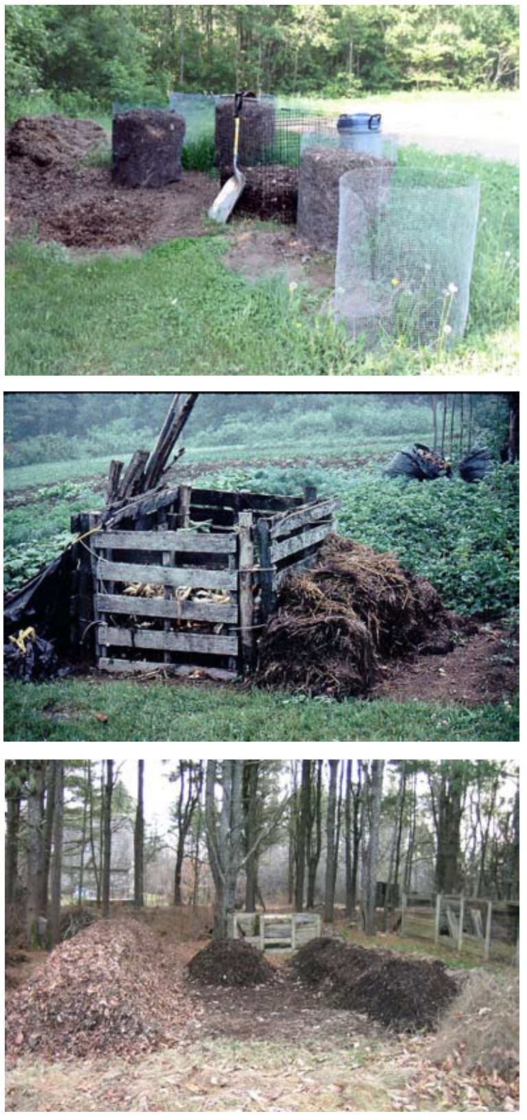
Compost can be made in piles, in simple, inexpensive bins or in fancy bins. The choice is simply a matter of esthetics.

1. Farm manure is one of the best sources of organic matter and can supply the bulk of the fertilizer elements that vegetable gardens need. The general rate of application for cattle, hog or horse manure is 300 to 500 pounds per 1,000 square feet of garden. A simple way to estimate this is to apply a layer 2 to 4 inches thick on top of the soil and work it in to a 6-inch depth. Poultry, sheep, goat and rabbit manures should be applied at half this rate because of their higher