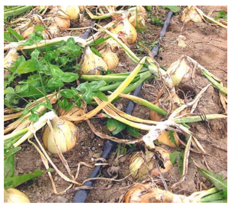
Irrigating a garden is often important. Drip tape, shown here, is one way to get water to the plants without wetting the leaves (which can spread diseases) or wasting water.

Soil Preparation. Fertilization requirements are similar to those for onions. Leeks should be planted in a trench about 6 inches deep. Gradually fill the trench during the growing season.