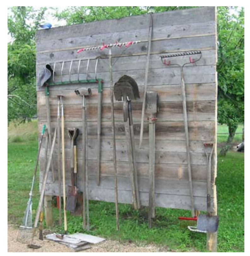
Note the different kinds of hoes. For a discussion of hoe types and their uses, see the Johnny's Selected Seeds catalog.

Culture. Corn is a heavy feeder, so prepare a fertile soil as noted under "Soil Preparation." Sidedress with some manure when plants are 5 to 6 inches tall. Early weeding is essential. Hilling soil around the base of plants will keep down weeds and offer additional support. After the tassels are produced, corn needs 1 inch of water per