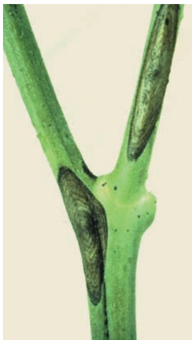
Fig. 3. Stem lesions caused by Alternaria solani .

early in the season, but the greatest damage usually appears after fruit set. Severe defoliation may occur during periods of high temperature and high humidity and expose fruit to sunscald.