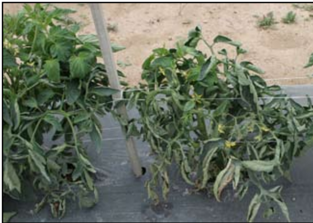
FIGURE 1. SYMPTOMS OF WILT DUE TO BACTERIAL CANKER

Bacterial canker is a potentially serious disease of tomato that can occur in commercial plantings and home gardens. This infectious disease is capable of spreading rapidly, resulting in devastating losses. It is a particularly difficult disease to manage because not only is there no cure, but the pathogen can be hard to eradicate once it has been introduced into a greenhouse, garden, or field.