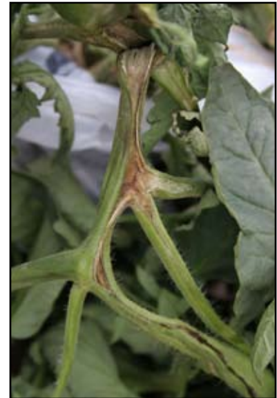
FIGURE 4. STEM CANKER AND PITH NECROSIS SYMPTOMS

Use certified pathogen-free seed and transplants. Avoid saving seed from previous crops unless necessary (i.e., heirloom tomatoes). If seed must be saved, avoid collecting seed from obviously diseased plants.