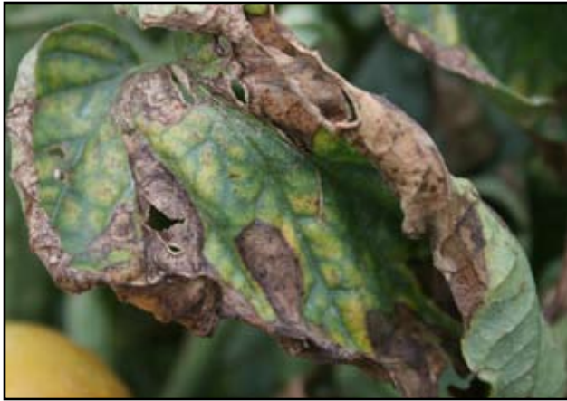
FIGURE 3. CLOSE-UP OF THE FOLIAR "FIRING" SYMPTOM

Secondary symptoms appear as a marginal browning or necrosis (also called "firing") on older leaves (FIGURES 3 & 4). Firing occurs when the populations of Cmm present on the leaf surface cause foliar infections. A yellow margin may border the brown tissue and affected leaves tend to curl upward.