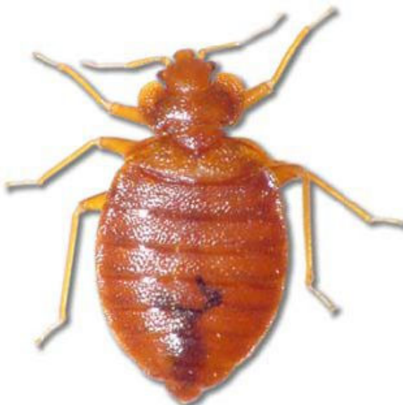
Adult Bed Bug

Bed bugs are insects, more specifically “true bugs”. True bugs have piercing mouthparts that in most species are used for feeding on plants. However, some species of bugs will feed on animal tissues. Bed bugs have mouthparts, which are adapted to feed almost painlessly on the blood of people. Human-associated bed bugs found in the U.S, Cimex lectularius , have a flat, oval-shaped body with no wings, and are 4–7mm long. Their color is shiny reddish-brown but after a blood meal they become swollen and dark brown in color (see picture below). There are three stages in the bed bug’s life cycle: egg, nymph and adult (see picture below). The eggs are white and about 1mm long. The nymphs look like adults but are smaller. Complete development from egg to adult takes from four weeks to several months, depending on temperature and the availability of food. Both male and female bed bugs feed on the blood of sleeping persons at night. In the absence of humans they can feed on mice, rats, chickens and other animals. Feeding takes about 10–15 minutes for adults, less for nymphs, and is repeated about every three days. Bed bug nymphs can survive for considerable periods (months) without feeding, depending on environmental conditions.