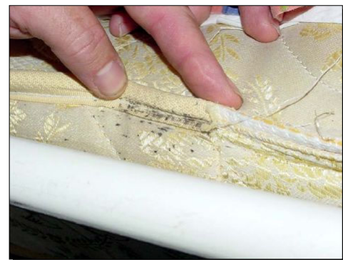
Blood spots on a mattress seam are often grouped. This is an indication of a current or past infestation of bed bugs.