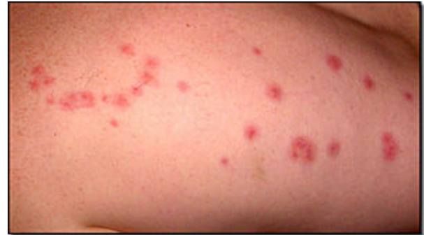
Reaction to bed bug bites. Bites are usually clustered on areas of the body not covered by night clothing.