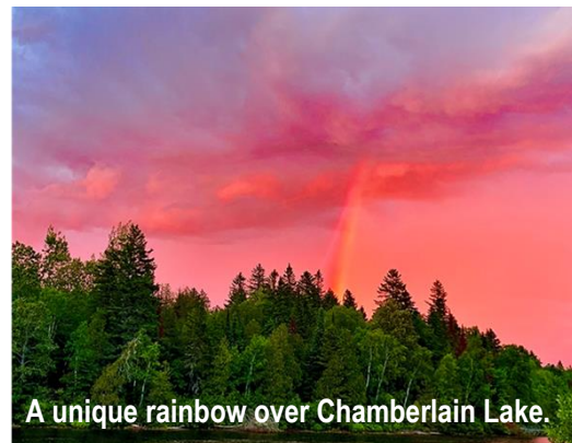
A unique rainbow over Chamberlain Lake.

AWW Donations Account: $5,456.72 was in the Allagash Wilderness Waterway donations account as of June 30, 2022.