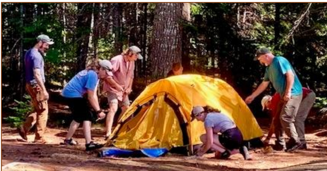
The AWW Rangers at Scofield Point setting up a tent as part of the camping safety training.

The AWW staff spend time every day informing and educating many Waterway visitors on a variety of topics, such as important safety tips, canoe/camping skills, rules and regulations, the history and culture of the AWW, recreational and sightseeing opportunities, and information about AWW flora and fauna.