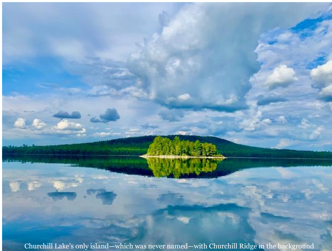
Churchill Lake’s only island—which was never named—with Churchill Ridge in the background