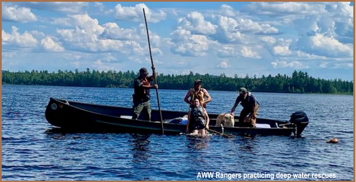
AWW Rangers practicing deep water rescues.