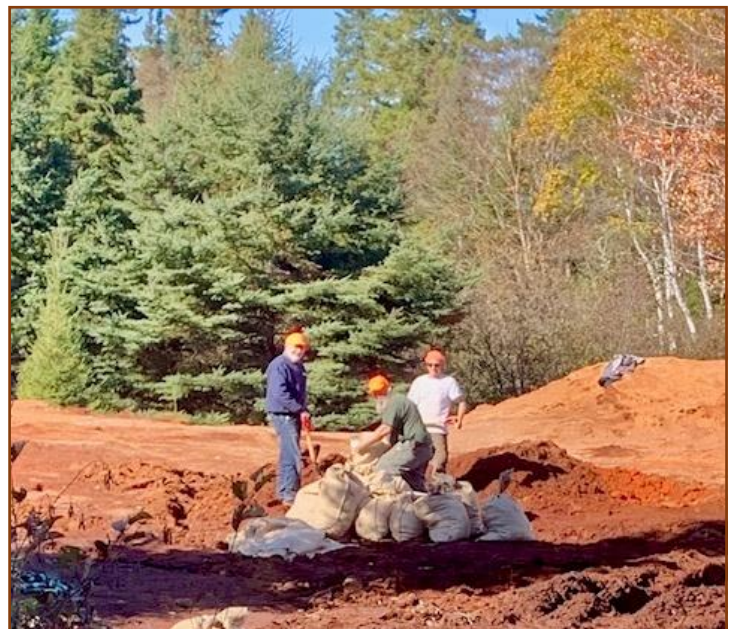
Rangers and volunteers filling burlap bags for leakage mitigation efforts at Telos Dam.