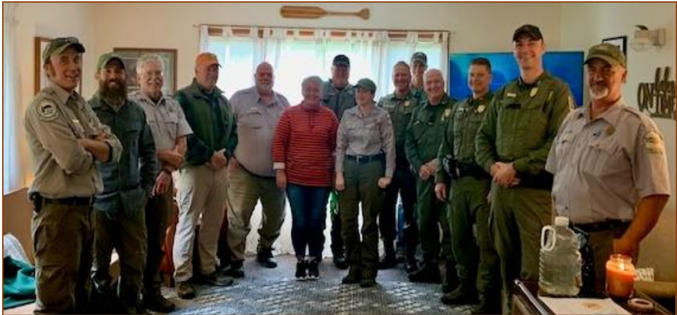
The AWW Team having an appreciation luncheon at Churchill Dam HQ with representatives from the Maine Forest Service, North Maine Woods, and IFW. We are fortunate to be surrounded by great partners – Thank you!