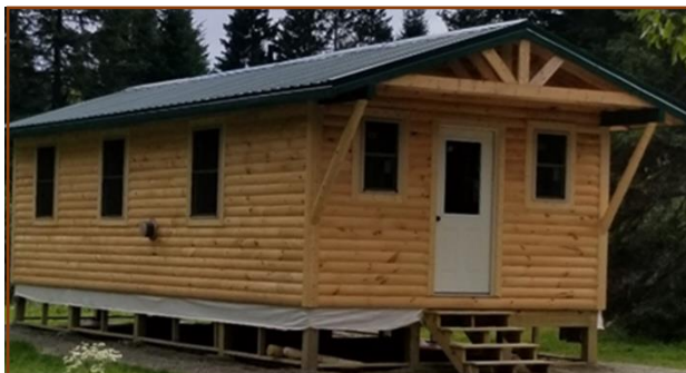
New Farm Brook Cabin at Michaud Farm