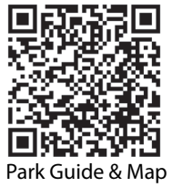
Park Guide & Map