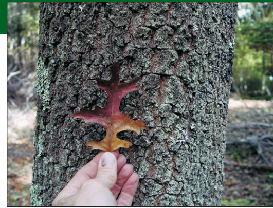
Scarlet Oak Leaf held against Oak Bark

by timber harvesting, clearing for agriculture, and residential development, uses that have reduced this naturally rare type even further. Community dynamics are not well known, but there are some indications that red oak regenerates more strongly than white oak at some sites and may replace it over time. Fire may also play a role in natural regeneration. Most occurrences of this type are on private lands.