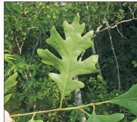
White Oak Leaf

This type offers habitat for a variety of birds, including scarlet tanager and ovenbird. Mature occurrences of this community type offer excellent potential sites for cavity dwellers such as the southern flying squirrel. The rare red-