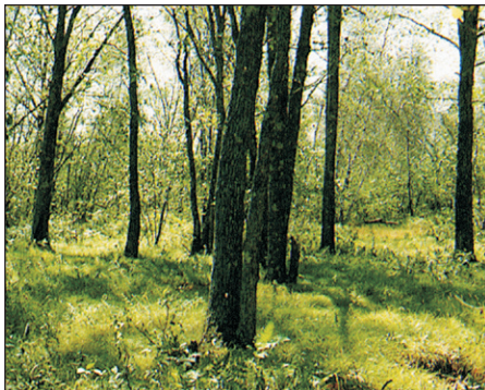
White Oak - Red Oak Forest

Forests dominated by a mixture of red oak and white oak, without a strong