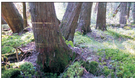
Floodplain High Water Marks