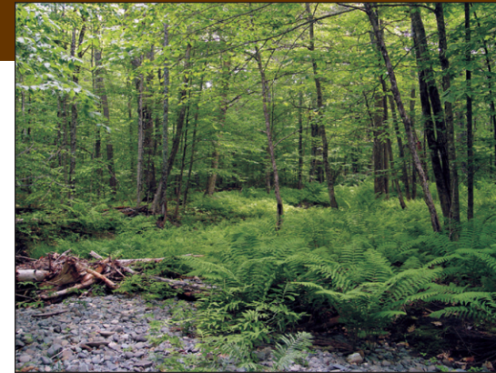
Upper Floodplain Hardwood Forest

drainages, usually sloping with steeper gradients.