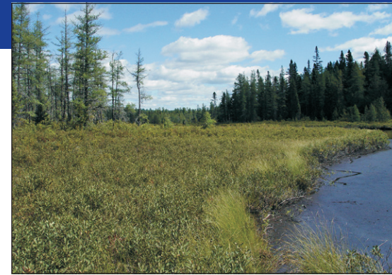
Sweetgale Mixed Shrub Fen

Community is known from this Ecoregion Community may occur in this Ecoregion Bailey's Ecoregion County