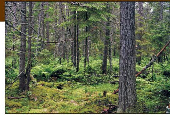
Spruce - Fir Wet Flat