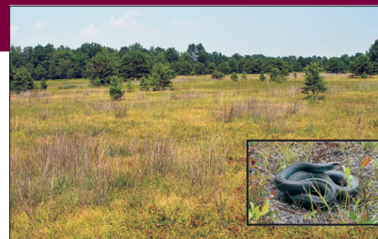
Main Photo: Sandplain Grassland Inset: Black Racer

Maine historically, but most nearby sites that might have supported this community have either been developed or have transitioned to other types due to lack of fire.