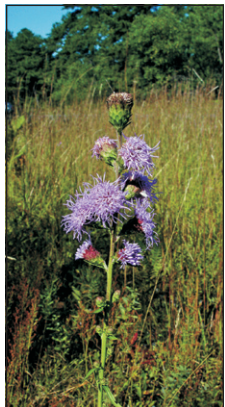
Northern Blazing Star

Sites occur on nutrient poor soils of glacial outwash plains or moraines south of 44 degrees latitude. Topography is flat to undulating. The xeric to dry-mesic, sandy soils are acidic (pH usually <5.0) and have little organic matter. Fire is an important factor in maintaining this community.