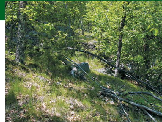
Oak - Ash Woodland