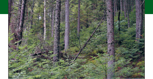
Montane Spruce – Fir Forest