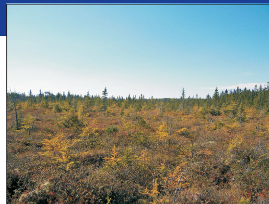
Huckleberry - Crowberry Bog

distributed, but has been subject to few threats to date. Slow vegetation growth rates, due to the nutrient-poor conditions, mean slow recovery from physical disturbances, such as recreational trail use. If disturbance, such as foot traffic, is a necessity, traversing during frozen conditions or using boardwalks can minimize impacts. Peat harvesting could threaten some sites. Changes to bog hydrology, through impoundment or draining, could lead to vegetation changes. Several occurrences are on public lands or private conservation lands.