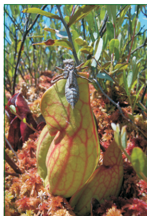
Pitcher Plant Leaf with Dragonfly Exuvia

Dwarf shrub peatland vegetation is characterized by dwarf huckleberry and/or black crowberry together forming >20% cover. Sheep laurel and leatherleaf are usually