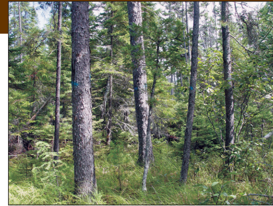
Black Spruce Bog

inhabits bogs with large numbers of dead trees. Palm warblers, common yellowthroats, and northern waterthrushes are specialists that breed primarily in this community type. The bog elfin butterfly uses black spruce as a larval host plant. The western pine elfin uses jack pine as its host plant in the Midwest but is associated with black spruce in Maine and may be found in this community in northwestern Maine. Thaxter's pinion moth uses larch as one of its larval hosts.