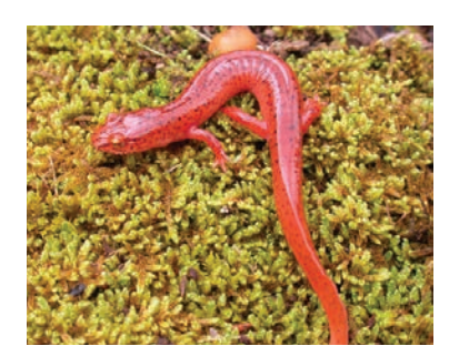
Spring salamander

bledown, was covered beneath a sheet of ice that was thousands of feet thick. Even though ice appears to be solid, it is constantly, slowly shifting when it takes the form of an ice sheet or a glacier. As this enormous ice sheet moved, it ground down pointy summits, widened valleys, and gouged out shallow depressions that would someday become lakes, like Tumbledown Pond.