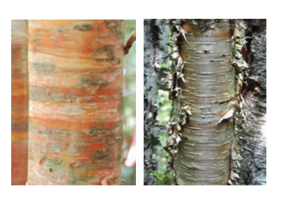
Heart-leaved birch, pink where outer bark has peeled away (left), yellow birch (right)