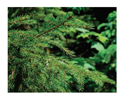
Red spruce branches