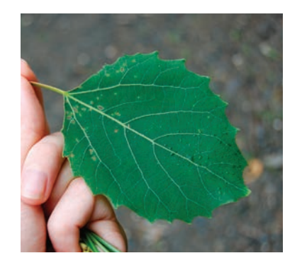
Bigtooth aspen leaf

You can find bigtooth aspen in this young forest surrounding the trailhead, where it towers above smaller sugar maples, birches, and American beeches growing along the small brook. The presence of bigtooth aspen in this forest indicates that this area was disturbed in the recent past, likely by a timber harvest. Aspens and some species of birch are trees that "specialize" in colonizing recently disturbed, open areas, whether the openings are due to fire, wind, or logging.