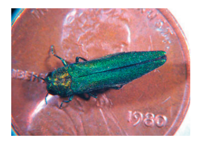
Adult emerald ash borer

Where the topography flattens at the base of several switchbacks, the forest has transitioned completely into a good example of a Northern Hardwoods Forest. New England's most abundant natural community, the broadleaved trees of this forest include American beech \P , sugar maple, yellow birch, and paper birch.