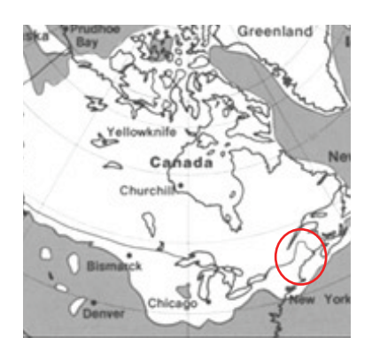
The maximum extent of glacial ice during Pleistocene time (2 million years ago to 10,000 years ago)