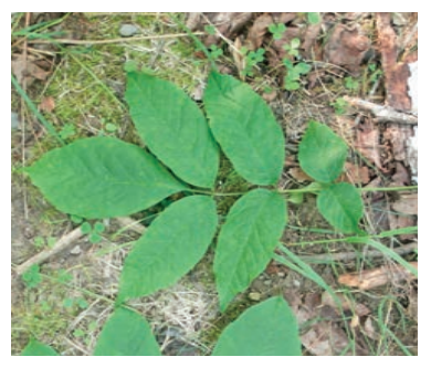
White ash leaf