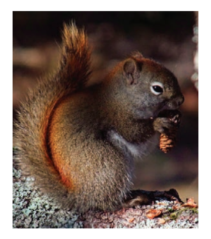
Red squirrel