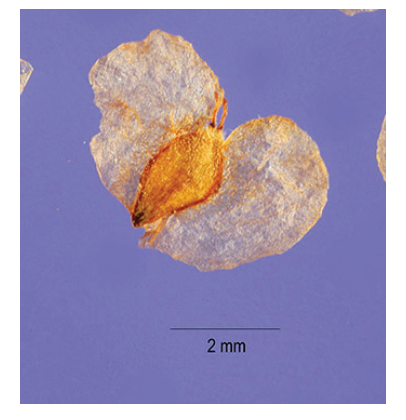
Magnified paper birch seed