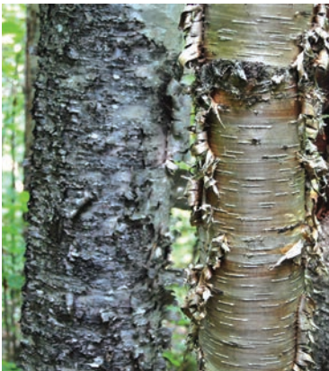
Dull, grayish white bark of a paper birch (left) beside glossy, golden bark of a yellow birch (right)

Downstream of here, Mountain Brook feeds into Berdeen Stream as one of its tributaries. Eventually, the water in Berdeen Stream enters the Swift River, then the Androscoggin River and the Kennebec River, finally entering the Atlantic Ocean at the Gulf of Maine.