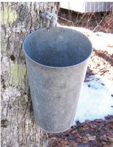
Tapped maple tree with sap bucket hanging from tap

(the largest). After the glaciers melted, plants colonized the till and aided in the development of a covering of soil.