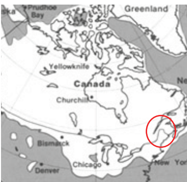
The maximum extent of glacial ice during Pleistocene time (2 million years ago to 10,000 years ago)

As recently as 17,000 years ago, Maine was covered entirely by a massive, slowly shifting sheet of ice that scraped and gouged everything that it came into contact with, rounding off mountains and broadening valleys. Gradually, the bottom of the glaciers became dirty with the sediments (clay, sand, gravel, and rocks) that they collected. When the climate warmed and the glaciers began to melt, they released this "load," mostly in the form of glacial till, which formed a thick layer atop the bedrock. Geologists describe till as "unsorted," meaning that it consists of a jumble of different-sized sediments ranging from clay-sized (the smallest) to boulder-sized