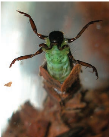
A caddisfly larva inhabits a long, narrow case built of tiny sticks or stones