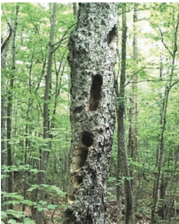
Pileated woodpecker holes in a diseased beech tree