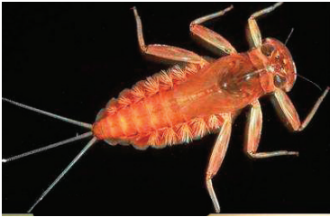
Mayfly nymphs usually have three “tails”