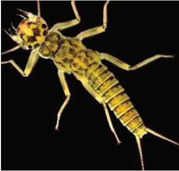
Stonefly nymphs usually have two “tails”