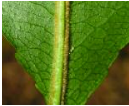
The rusty hairs along the midvein on the back of the leaf distinguish black cherry.

The wood is rather hard, close-grained, light, strong and easily polished. It is used for furniture and cabinetry, interior finishing, woodenware, veneer and plywood. It is valued as firewood due to its high heat value and fragrance.